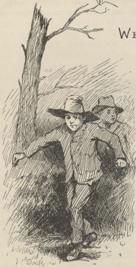
THEY TIP-TOED ALONG.

WE went tip-toeing along a path amongst the trees back towards the end of the widow's garden, stooping down so as the branches wouldn't scrape our heads. When we was passing by the kitchen I fell over a root and made a noise. We scrouched down and laid still. Miss Watson's big nigger, named Jim, was setting in the kitchen door; we could see him pretty clear, because there was a light behind him. He got up and stretched his neck out about a minute, listening. Then he says,